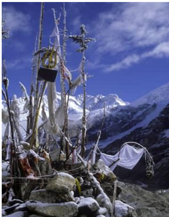
Chorten, Okten Kangchenjunga South

Our trek starts with a climb through the lush farmlands of the mostly Buddhist communities of the Kiranti, Tamang and Sunwar peoples. Several days of up and down bring us to the approach to Kangchenjunga's south face and the awesome Yalung Glacier. We then traverse the 4640m pass Mirgin La, from where the peaks of Makalu, Chamlang and Everest may be visible. Descending the pass on the other side we follow the route to the north base camp of awesome Kangchenjunga, which was pioneered in 1979 by Doug Scott and his fellow climbers as they prepared for the third ascent of the summit.