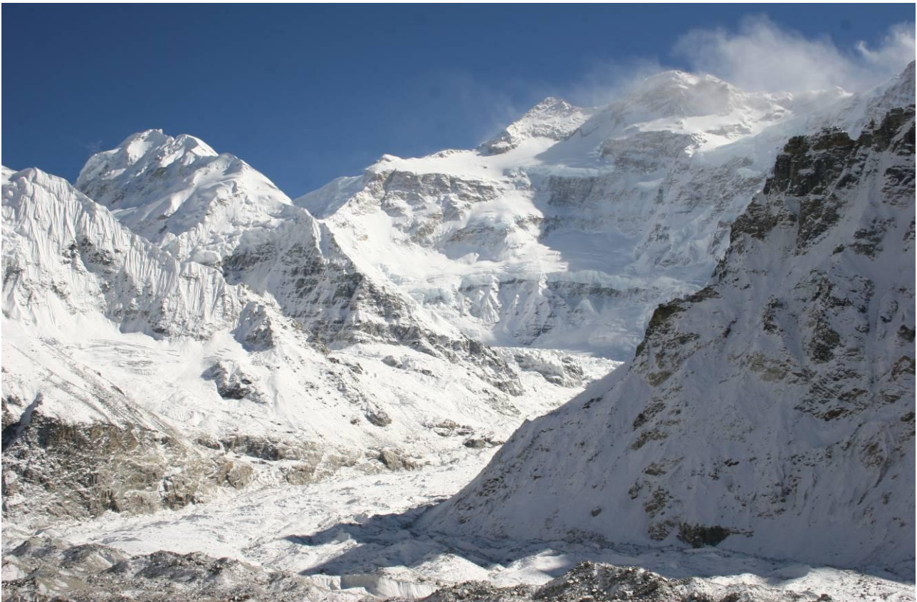
Kanchenjunga from north base camp (David Geddes)