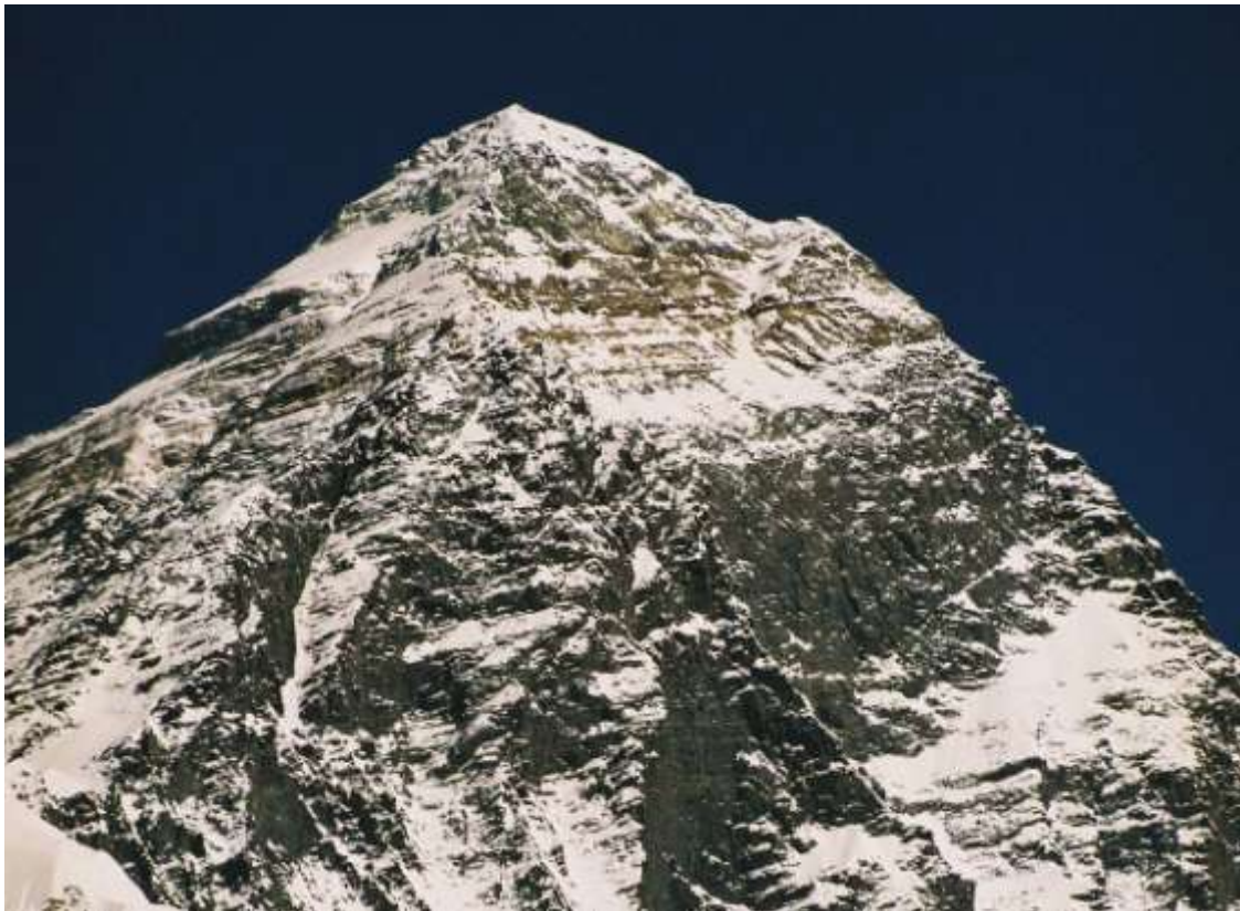
Everest from Kala Pattar

Grade: Fairly strenuous Duration: 17 days land-only Trekking days: 13 days Maximum altitude: 5,623m Land-only price: £1250 Land-only dates: 12 – 28 November 2009