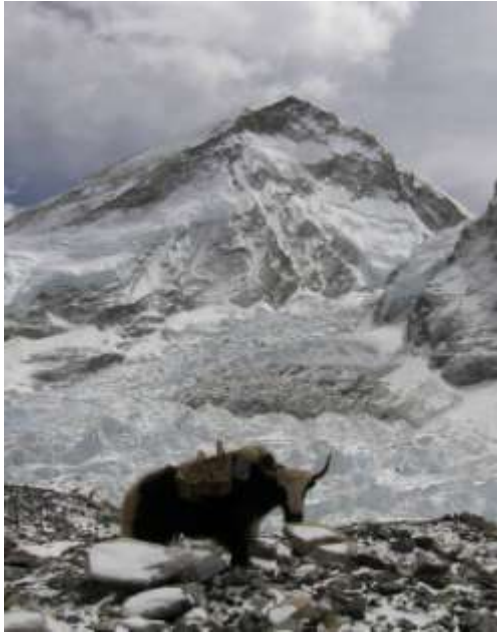
Yak at the Khumbu Ice Fall