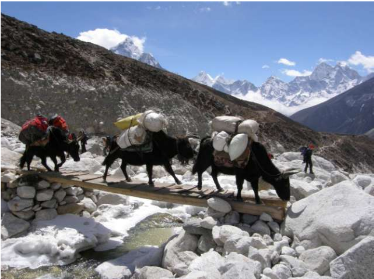
River crossing en route to Lobuche

Trail is delighted to announce that it has arranged through CAT a special offer for our readers for this autumn. The trek will depart from Kathmandu on 12 th November 2009 and return to Kathmandu on 28 th November.